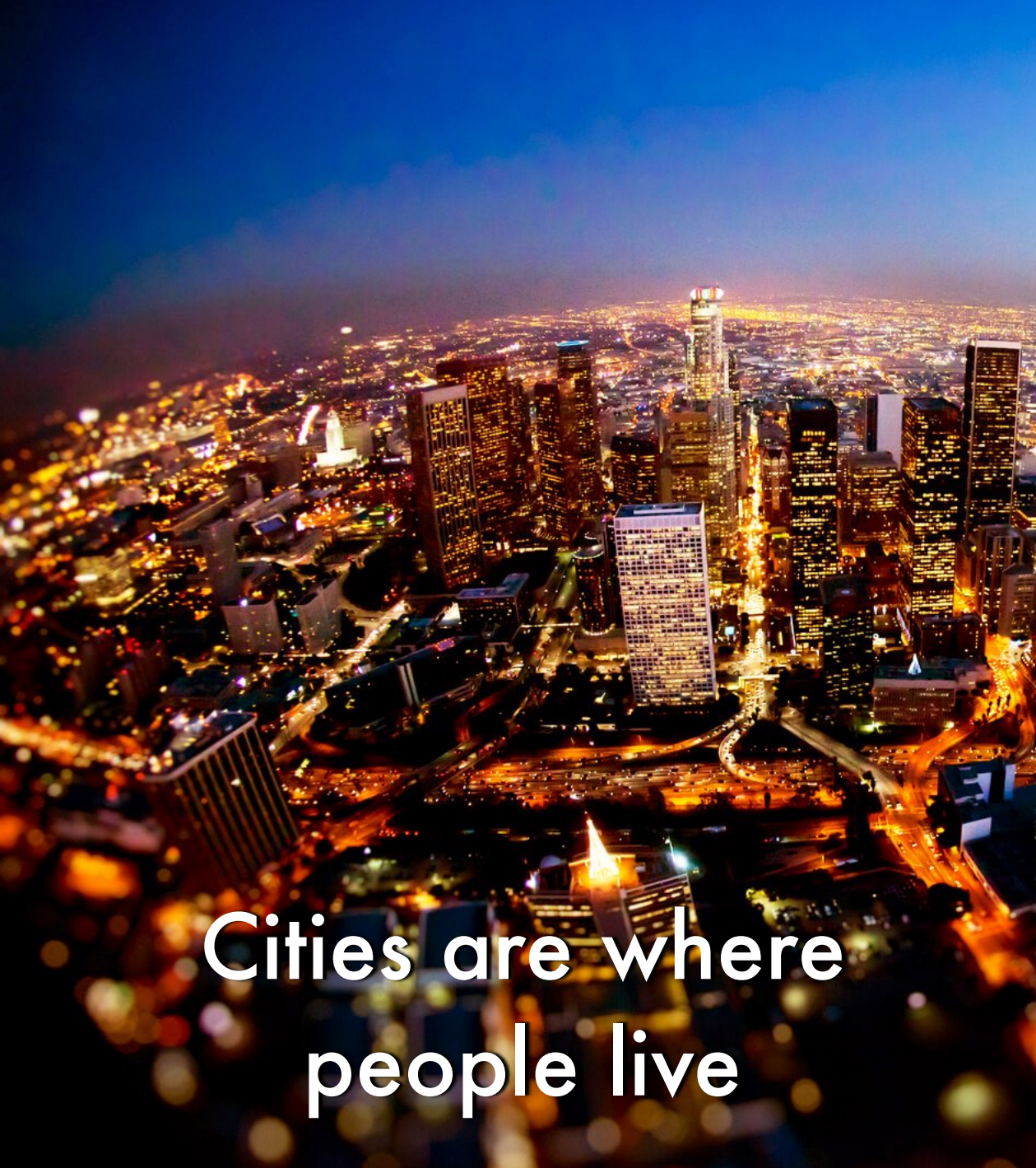
Cities are where people live