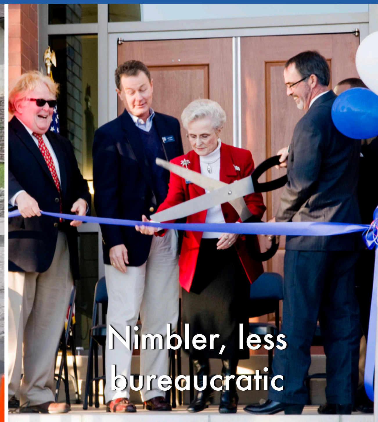
Nimble, less bureaucratic