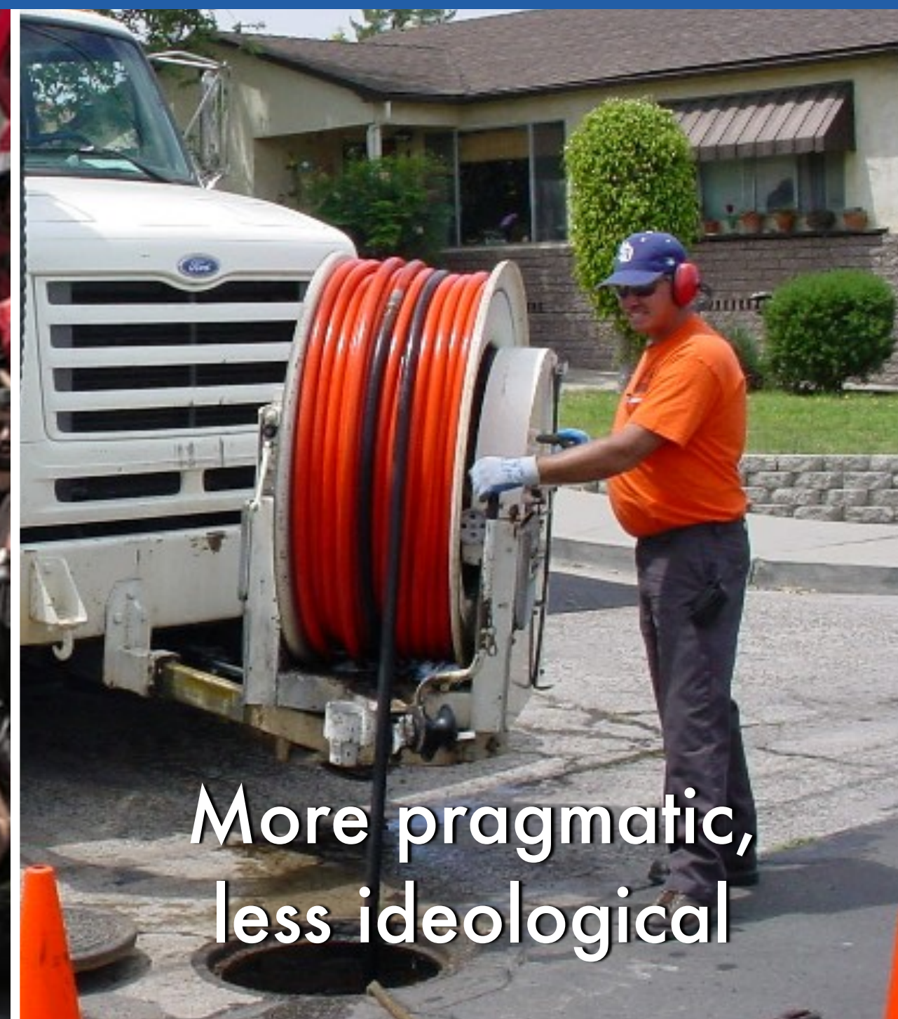
More pragmatic, less ideological