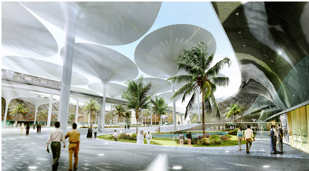
Figure 4: Masdar City's green veneer "reminds" us that grey interventions are sustainable.

renderings, promotional photographs, and the city's master plan, residential areas, schools, and the visitor center are surrounded by plants, trees, and green lawns (Figure 4). Photographs of many of the development's office and research buildings are foregrounded with foliage, signalling the LEED certifications of the buildings and the alternative energy research occurring inside (Masdar 2015). The city's plans also include "biodiversity protection areas" and green corridors that are to provide habitat for native species and serve as recreational areas (Masdar 2015: 56). In each of these designs and representations the green veneer of palm trees and gently waving grasses "remind" us in everyday, phenomenal terms that Masdar City is designed to promote more sustainable ways of living and working.