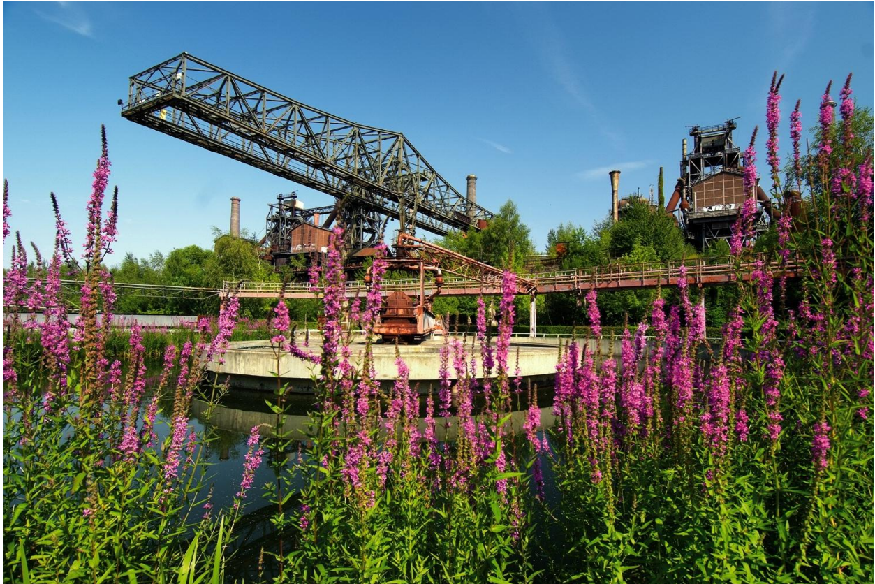
Figure 2. Landschaftspark Duisburg Nord's Industrienatur, combining green and grey

riverbed was completely destroyed – along with highly-engineered “lakes,” floodplains, and catchment areas to manage its ebb and flow (Danish Architecture Center 2017).