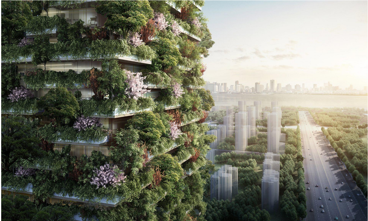
Figure 1: A paradigmatic representation of urban sustainability as green and grey; in a render of the proposed Nanjing Green Towers (credit: Stefano Boeri Architetti).

distinction between green urban nature and grey urban nature . Green urban nature is the return of nature to the city in its most verdant form, while grey urban nature is the concept of social, technological urban space as already inherently sustainable.